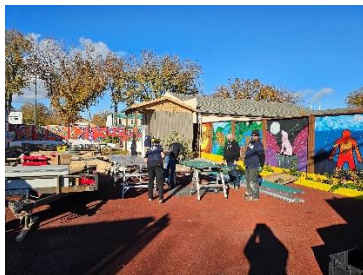
Garden Shed Being Built