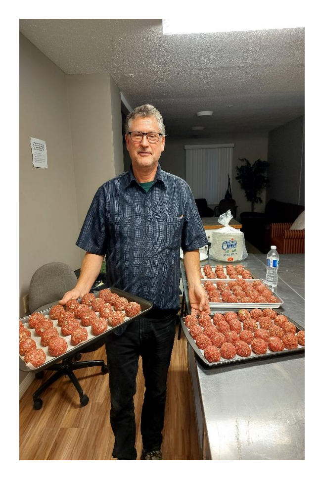
In addition to snacks, and with the help of a few friends, we served 30 students a Mashed Potato, Meatball and Vegetable Dinner during exams.

other snack, and fruit juice as they are studying for exams.